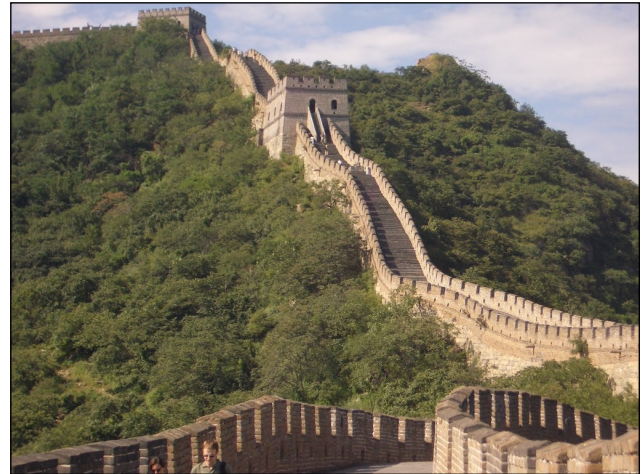
The Great Wall of China.

Overall, I really liked living in China, and I think many other people would enjoy living there, too.